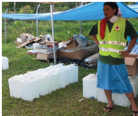
A Samoa Red Cross Society volunteer at Lalomanu Hospital on the south coast of the island of Upolu in Samoa gets water ready for distribution to people who fled the coast after the tsunami.

On behalf of the Samoa Red Cross, the International Federation would like to thank all Movement partners and all concerned parties for the tremendous efforts being made to assist Samoa Red Cross.