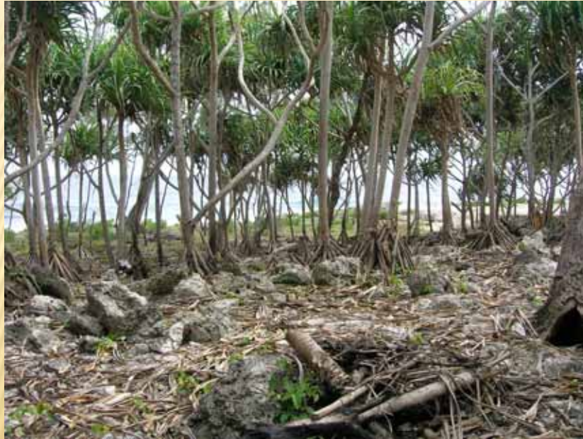
Storm ?, tsunami ? Deposit, Devil Point, Efate