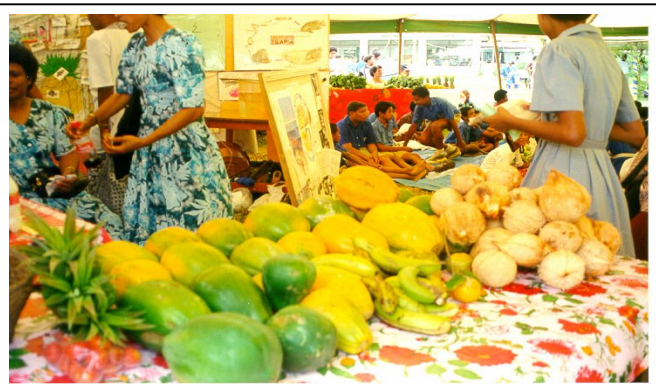
Oct. 23, UN World Food Day in Savusavu