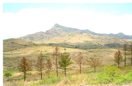
Middle ground, all newly planted <2yr old pine trees, heated from rock substrata, perished.