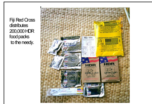
Fiji Red Cross distributes 200,000 HDR food packs to the needy.

All rations except the HDRs have had supplementary character, in that their nutritional content only meets part of the daily requirements. The current monthly adult ration issued by the government of Fiji (4 kg rice = 4,920 kcal, 4 kg flour=13,880 kcal, 2 kg sugar=7,760 kcal, 4 cans of 425 g mackerel = 3,111 kcal) provides a total of 29,671 kcal in supplementary energy. This translates to approximately 990 kcal per day or 47 % of minimum energy requirements of 2100 kcal (light level of physical activity). The total daily contribution of protein is 28g, equivalent to about 50% of