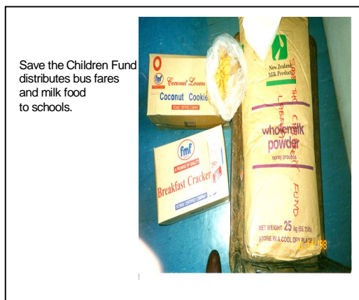
Save the Children Fund distributes bus fares and milk food to schools.

A HDR consist of 8 airtight sealed, vitamin enriched food items: Biscuit, Short bread, Strawberry Jam, Peanut Butter, Fruit Pastry, Fruit Bar, Lentil Stew, Beans in tomato sauce (Salt, pepper, red pepper, spoon, matches). No dates of expiry were to be found on the ration packs.