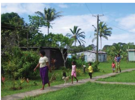
Participants from the PCIDRR Naimalavau village flood scenario, July 2009