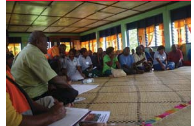
PCIDRR Naimalavau scenario debrief, July 2009

During the month of July, 2009, meetings and consultations were held in Suva, Fiji with the following organisations: