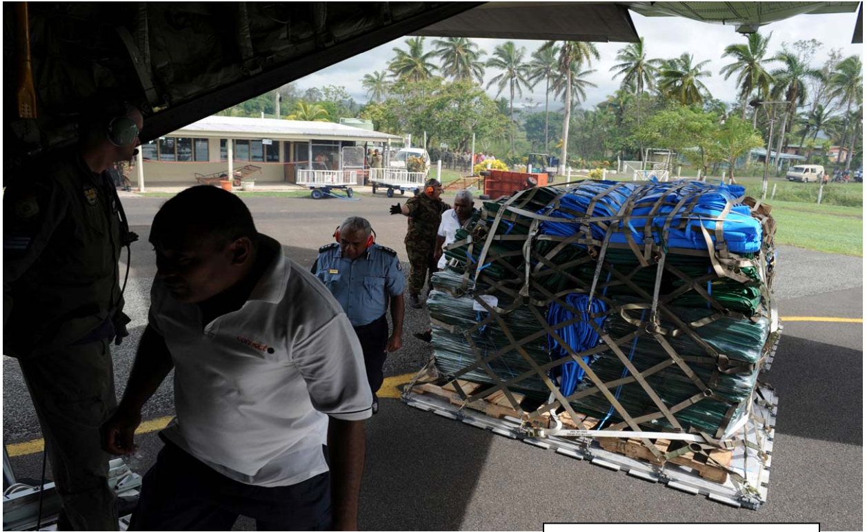
Royal New Zealand Airforce Aircraft at Labasa for Distribution of Immediate Relief Supplies