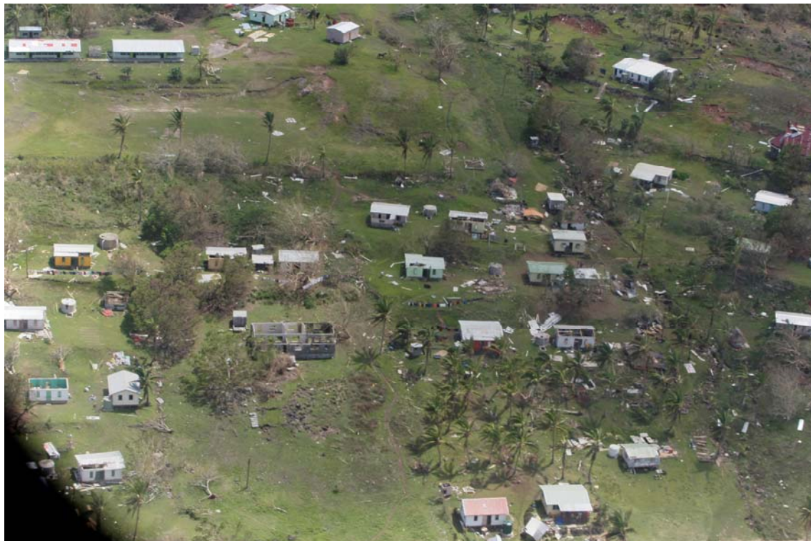
Island of Nayau

8.4 Initial relief packs by the Fiji Red Cross Society, JICA and UNICEF included, blankets, towels, matches, sanitary items and mini first-aid kit. Secondary relief included tarpaulins, cooking utensils, stoves and fuel, and water containers.