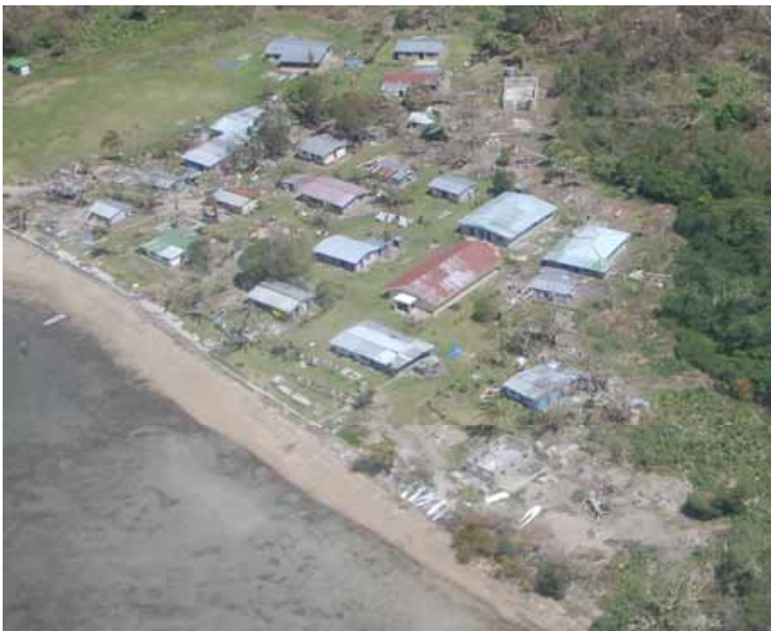
Damage at a village on Beqa Island.