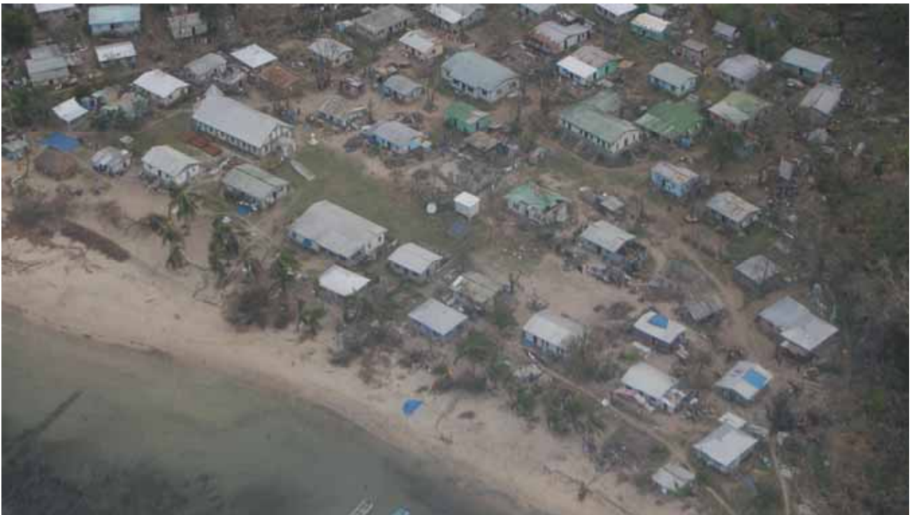
Damage at a village in Yasawa

12.12 There is a need for Divisional Commissioners to determine/ verify the extent of the damage to private dwellings. Government needs to identify an appropriate mechanism for damage assessment, criteria for house damage and appropriate ration scales for affected people.