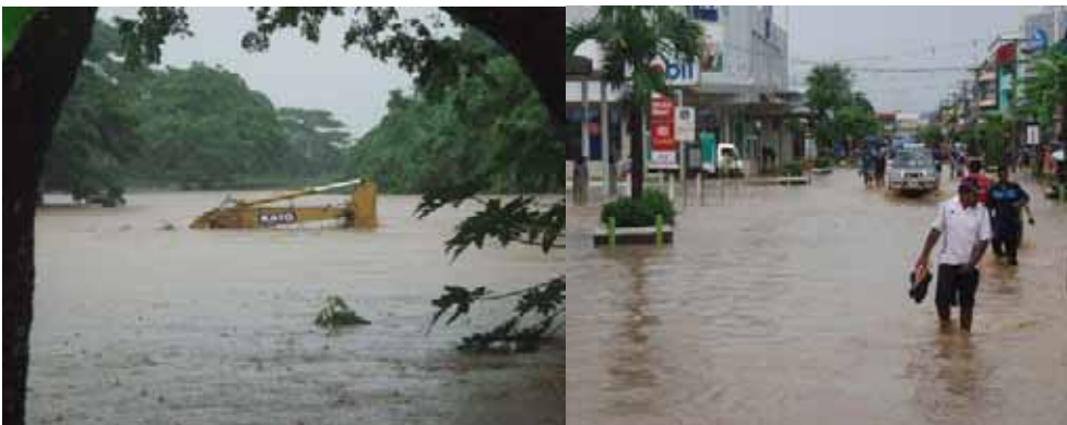
Flooded Nadi River and the main street of Nadi Town

Prepared by: National Disaster Management Office, 2007.